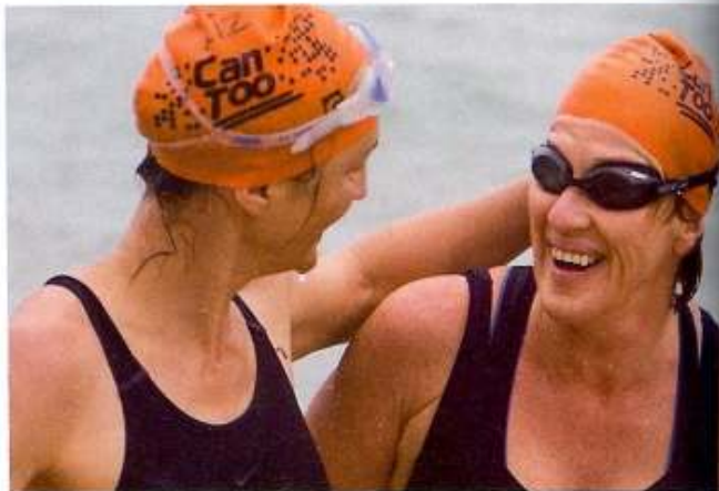
Can Too's swim programmes professionally train participants for 1km, 2km or 2.7km ocean swimming events

need to raise varies depending on the race they're training for, ranging from $800 for the ten-week running programme to $2000 for the 20-week marathon training.